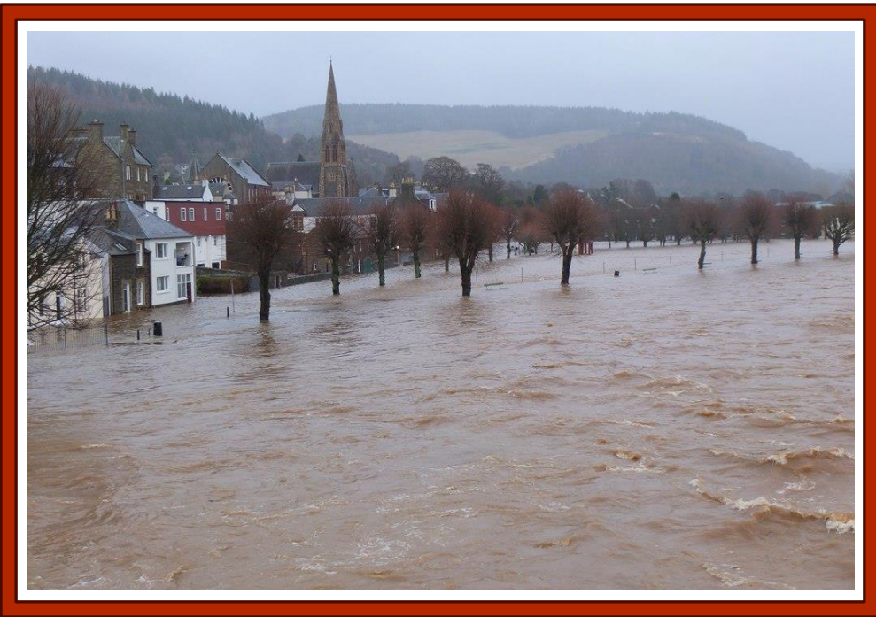
Flooding across Tweed Green, Peebles by Jim Barton

Shared under www.creativecommons.org/licenses/by-sa/2.0/deed.en